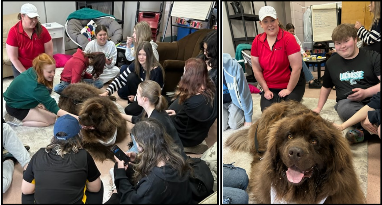
Schools Plus hosted Franklyn the Newf, a St. John Ambulance therapy dog during lunch on Thursday, April 24. Many of our students stopped by to visit with this gentle giant and got some pets and snuggles in, all in support of mental wellness.