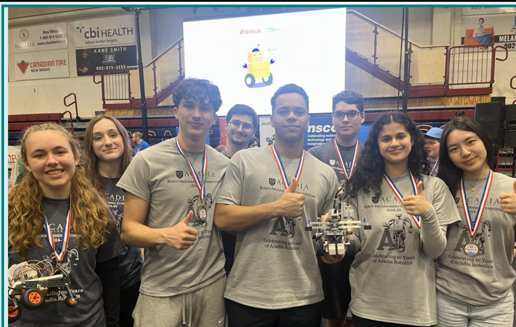
Auburn's Robotics Team placed 3rd at Acadia University's Robofest.

Follow us on Instagram, @auburnstudentservices and check on the bulletin board in Student Services & the website regularly for updates on available scholarships, bursaries and other school news.